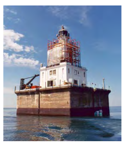
The DeTour Reef Light major exterior and interior restoration project is nearly complete.

DRLPS is a volunteer nonprofit 501(c)3 organization established in 1998 to restore and preserve the DeTour Reef Lighthouse for all to enjoy. Donations are tax-deductible as allowed by law. EIN 38-33872252 • MICS 27001 We'll Keep the Light on for You!